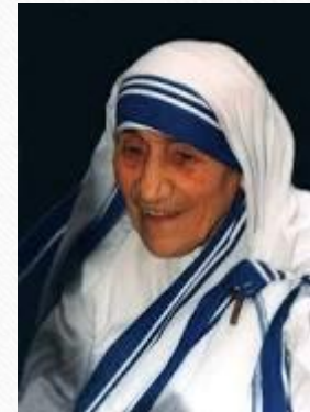
Our Class Saint, Mother Teresa was a very famous Nun

https://www.youtube.com/watch?v=jkLt4iJOKRU