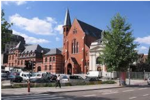
Convent Van Maerlant (City of Brussels)

Click on the link below to watch the short film: Life in an Enclosed Convent