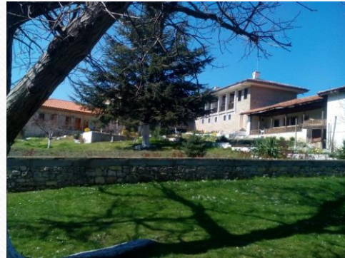
Monastery of Saint Athanasius, Bulgaria, was the first Christian monastery established in Europe in 344